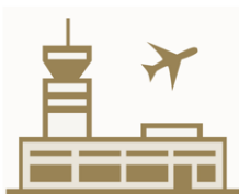
Grow Responsibly Support city growth and ensure BNE is a sustainable destination